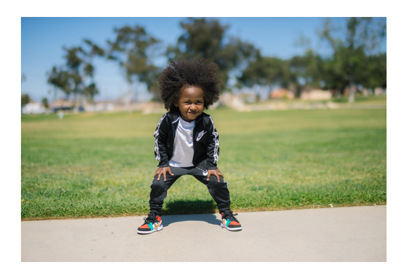
PREPARED BY HELP ME GROW NATIONAL CENTER June 2020 © Copyright 2020. All rights reserved.

The HMG National Center and Affiliate Network continue forward alongside families, persisting in the identification and implementation of strategies to promote the wellbeing of communities in the context of a COVID-altered world. Together, there is a broad and bright collective opportunity in bridging the exploration, ideas, and efforts developed to mitigate the impacts of crisis on families and evolve to meet new and expanded needs in a post-pandemic America.