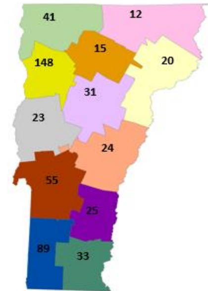
# of EL Providers Trained